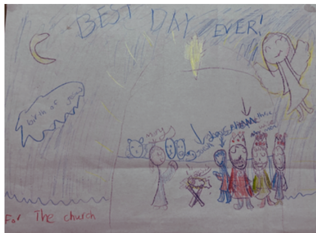
Ava Simpson - 'Best day Ever' (Crayon on Paper)

Throughout Advent we will focus on themes connected with the coming of Christ Jesus from the Old Testament book of Isaiah and paired readings from the New Testament on the theme: "A future vision - prompts present faithfulness"