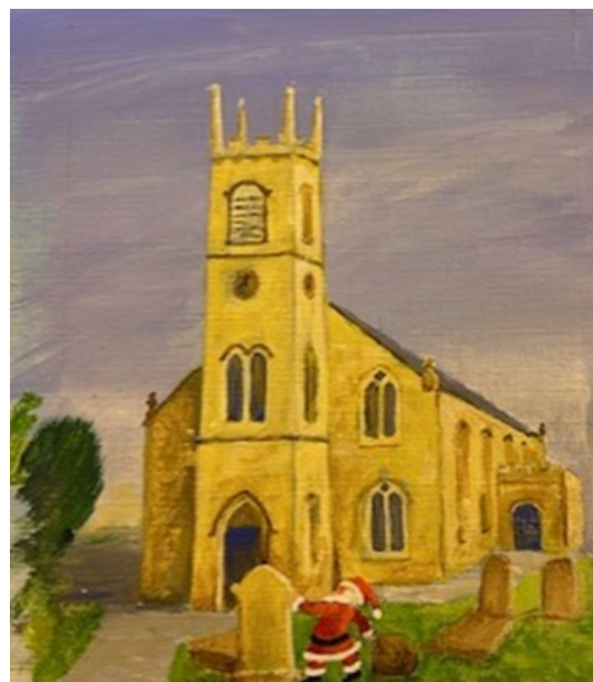
Ian Bassham - watercolour on paper; artwork for Christmas Card to celebrate the 200 th anniversary of the Rosemarkie church building.