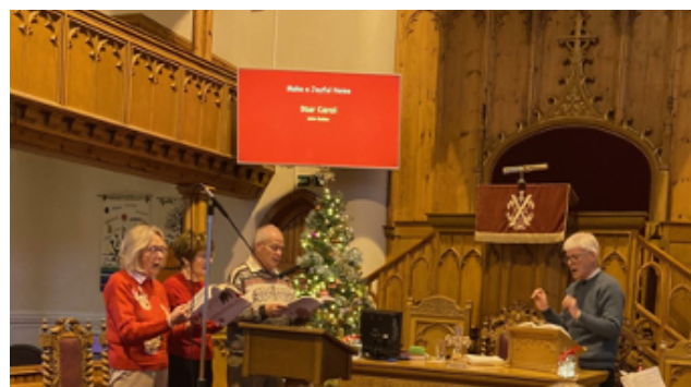
Every Sunday morning - the service is followed by a time of tea and coffee.