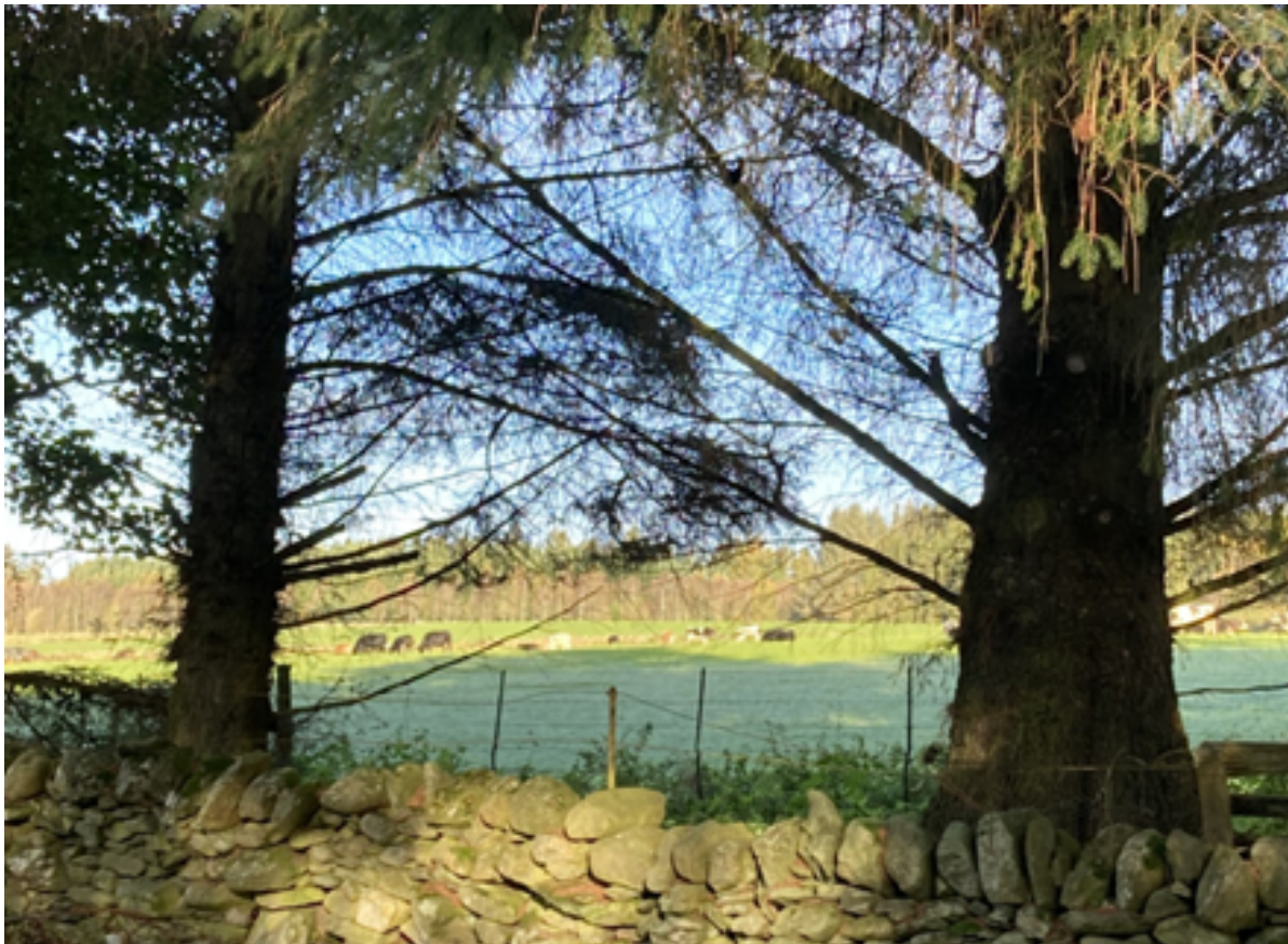
BIE - “Gathered stones in a dry-stane dyke “

There is much in our present-day society that deserves rejection but so much potential also for sound community living.