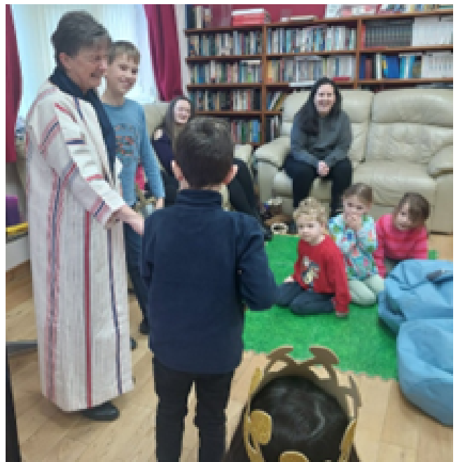
Urray & Kilchrist CofS - https://www.muiofordcofs.co.uk/